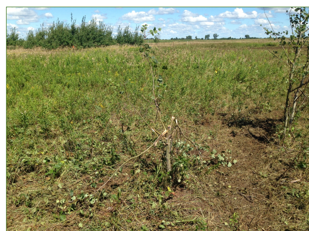
Observations of cattle browsing (left) and damaging brush (right) in 2016.